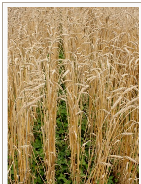
The Zorro variety of winter wheat growing with an undersowing of red clover.

Choose fields with low weed pressure. Weeds impact grain quality in multiple ways: competition for nitrogen and other resources can reduce yield and protein; green weed material in harvested grain can raise moisture and cause spoilage; and weed seeds can be difficult to remove through cleaning. While winter wheat is very competitive with annual weeds, perennial weeds such as quackgrass and Canada thistle can pose serious problems. If following sod, allow sufficient time to kill perennials through tillage or herbicides before seeding wheat. For spring wheat, avoid fields with a history of weeds that germinate in early spring like wild mustard, as well as perennial weeds. In addition, to give spring wheat an advantage over emerging weeds, plant the crop as early in the spring as possible and immediately following final seedbed preparation. If warranted and conditions allow, use a spring-tine harrow or rotary hoe to control small annual weeds before crop emergence or after the 3-leaf stage.