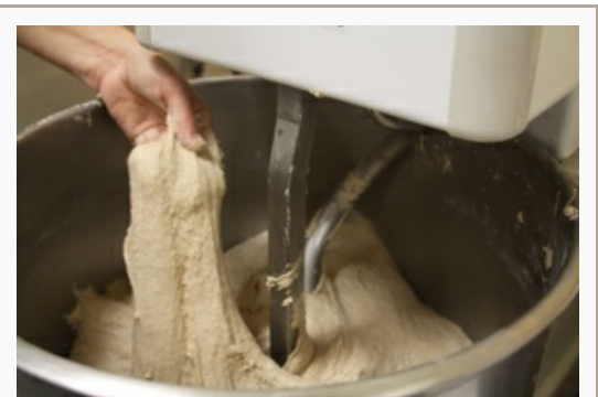
How flour performs as dough in the bakery is the result of many factors on the farm.