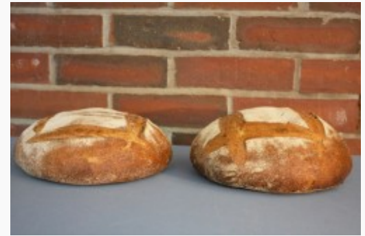
Bread baked from wheat grown in the University of Maine winter wheat variety trials shows the importance of adequate grain protein for good loaf volume and texture. The variety Jerry with 10.9% grain protein (on left) compared with the variety Redeemer with 12.3% grain protein (on right).