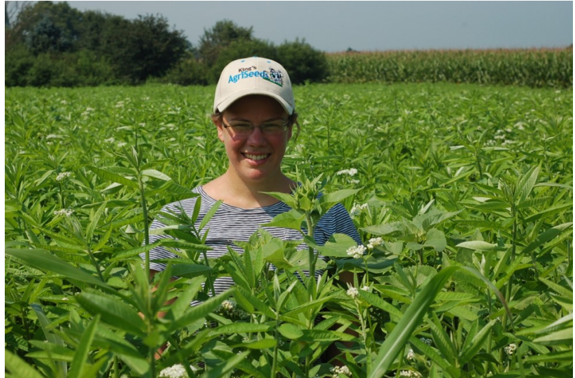
Neck-deep Summer Solar Mix in the experimental stages, with buckwheat in bloom.

The cowpeas are tolerant of heat and drought and can be grown on poor soils. Due to the fact