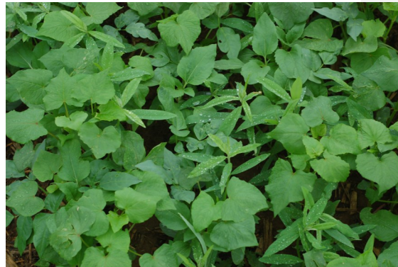
Summer Solar Mix 18 days after planting. Its broadleaves grow a thick canopy for weed suppression early

Both conventional and organic growers will find this a useful break crop in between spring and fall crops that builds soil nitrogen levels and attracts pollinators and other beneficial insects. It can also be used in farmscaping strips to draw beneficials throughout the season.