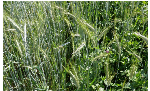
Late milk triticale on left yielded 16.65 ton/a while a mix of red clover and triticale on right yielded 21.3 ton/a. Both were direct harvested June 15

Our concern was that it may be getting a little dry for silage at soft dough, and that it is slightly short on protein for growing heifers. In an effort to correct this, we planted winter triticale and red clover the last week in August (after Sept 1 red clover does not work). The following spring we added 40 lbs/a of nitrogen and then harvested at late milk/early soft dough stage of both triticale and triticale with red clover. In our trial in 2012, this produced 16.65 tons/a of 35% dry matter material in the triticale alone . For the mix stand, red clover was in full bloom. We increased the yield almost 30% with the addition of clover to 21.3 tons/a of silage . With both harvests taken on the 15 th of June, another crop could be grown, or in our