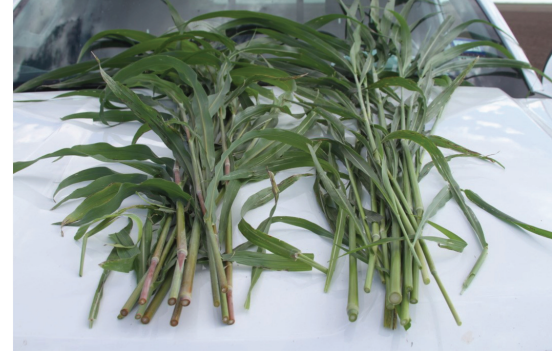
Left: KF Sugar-Pro 55 SS BMR (thinner stems and more economical to plant), Right: Promax BMR

Life Cycle: Annual Ease of Establishment: Good Drought Stress: Good Minimum pH: 6.0 Silage/Greenchop: Excellent Rotational Grazing: Excellent Digestibility: Excellent Palatability: Excellent Fertilizer: 1-1¼ units N per growing day First Cutting: 30-45 days Second Cutting: 30-35 days Double Cropping: Excellent